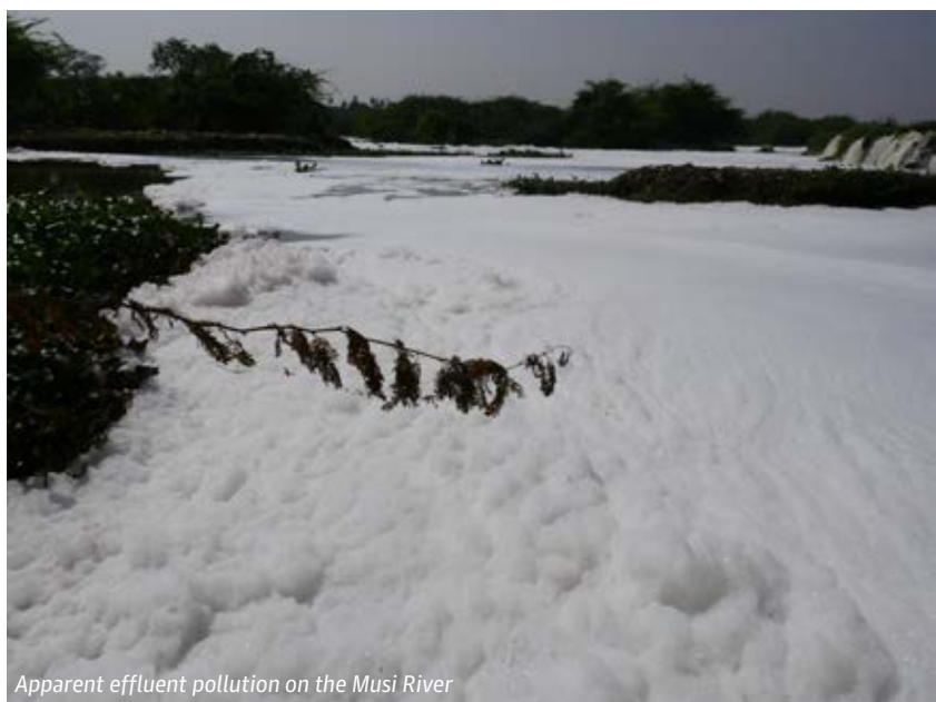
Apparent effluent pollution on the Musi River

Herds of buffalo and goats graze the surrounding land, but very little can be grown since the soil is so toxic. An informant told the team of an incident (undated) when a large chemical dump had entered the lake, and buffalo who were in the water emerged with their skin hanging from their bodies. It should be noted that the area was deemed "critically polluted" on the Central Environment Pollution Index (CEPI) assessed by the Central Pollution Control Board (CPCB) up until the early 2000's, then was de-notified around 2009 when its overall score fell below 70, then re-notified when the score rose in 2013 to 76 at a time when pharmaceutical pollution was greatly increasing in the industrial area.