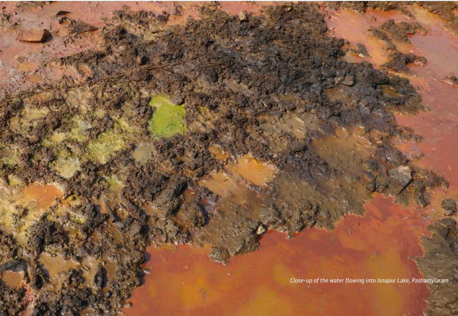
Close-up of the water flowing into Isnapur Lake, Pashamylaram

been ignored and view the development of India's manufacturing capacity as mainly providing an opportunity for Western economies to move away from dirty goods manufacturing by exporting it to India. 67 This has generated "significant costs for local populations in terms of loss of assets, health, natural resources and quality of the environment." 68