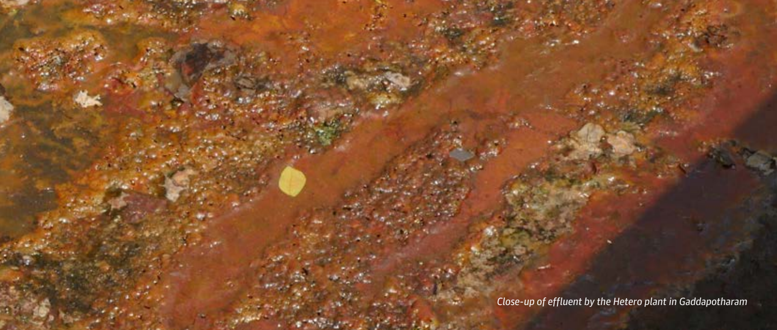
Close-up of effluent by the Hetero plant in Gaddapotharam

There are several elements to consider when assessing the pharmaceutical sector's environmental footprint. One is the energy used during production and processing. Another is the generation of waste-solid, liquid or airborne - from the manufacturing process. While pharmaceutical contamination of water has only recently permeated the public consciousness, it has been on the scientific community's radar for decades. There is now a compelling body of research on the negative effects resulting from the accumulation of pharmaceuticals in the environment, which range from the near elimination of entire species 3 to the feminisation of fish 4 and the spread of antimicrobial resistance (AMR).