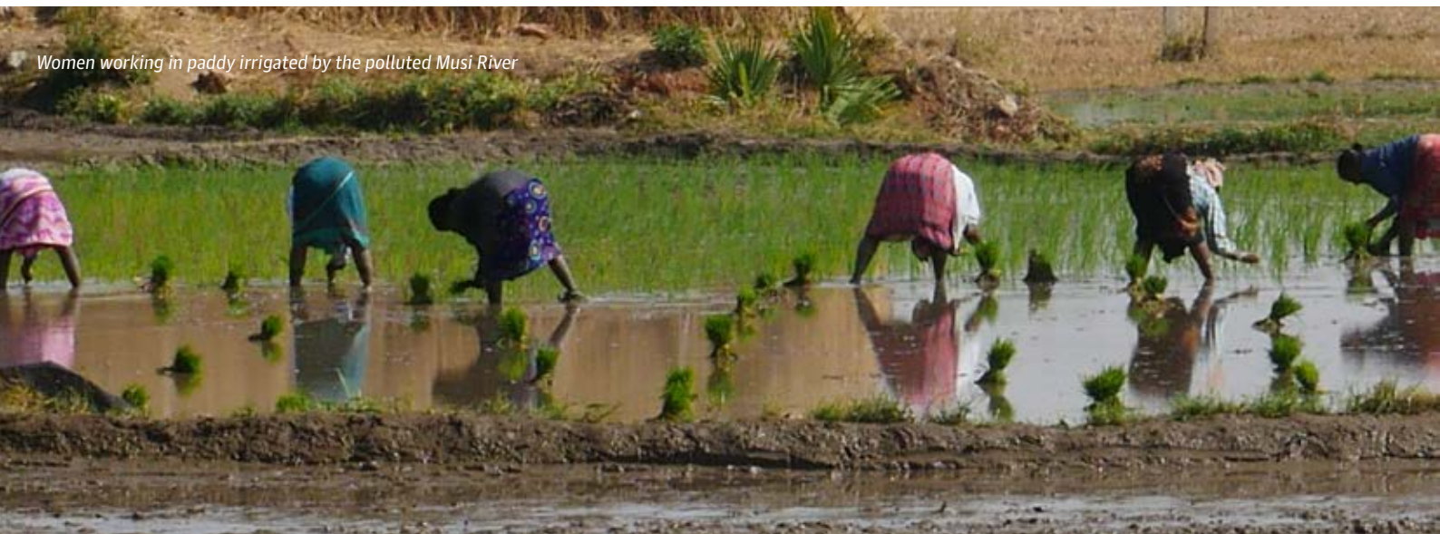
Women working in paddy irrigated by the polluted Musi River

A farmer interviewed for the investigation said that buffalo no longer mate naturally, and have to be artificially inseminated to produce young - this is very costly for the farmers as it may take 3-4 attempts to be successful. The milk produced by the animals fetches a very low price as it smells bad,