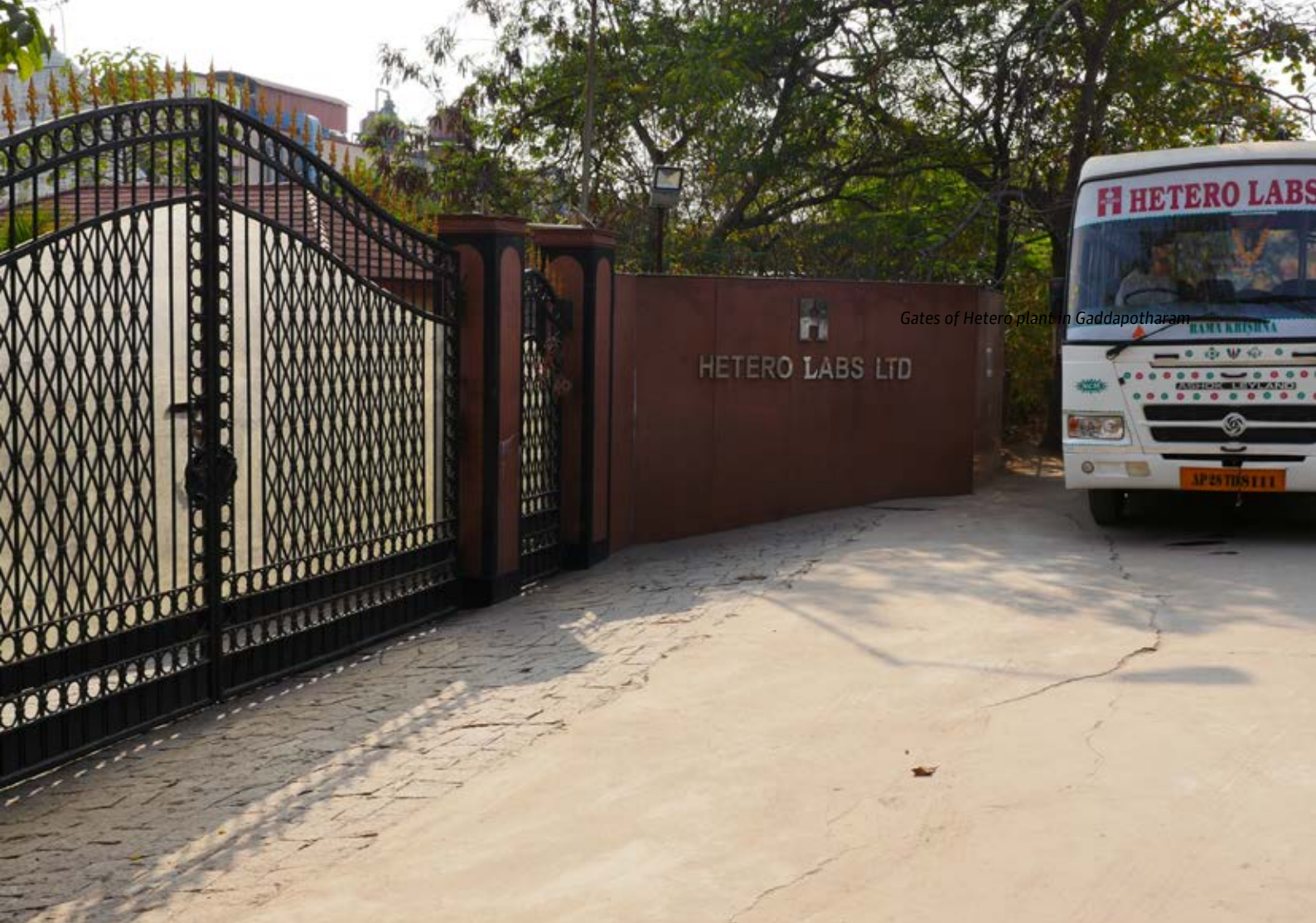
Gates of Hetero plant in Gaddapotharam

year, and the company has also extended its perimeter into the surrounding common land/forest without permission. An informant alleges that the Telangana Chief Minister Mr Chandra Shekha Rao has a commercial interest in the Hetero factories - as with the Hetero plant in Visakhapatnam (see section on Visakhapatnam below). This, if true, might explain the apparent impunity with which Hetero pollutes in this village despite much public campaigning and attempts at prosecution.