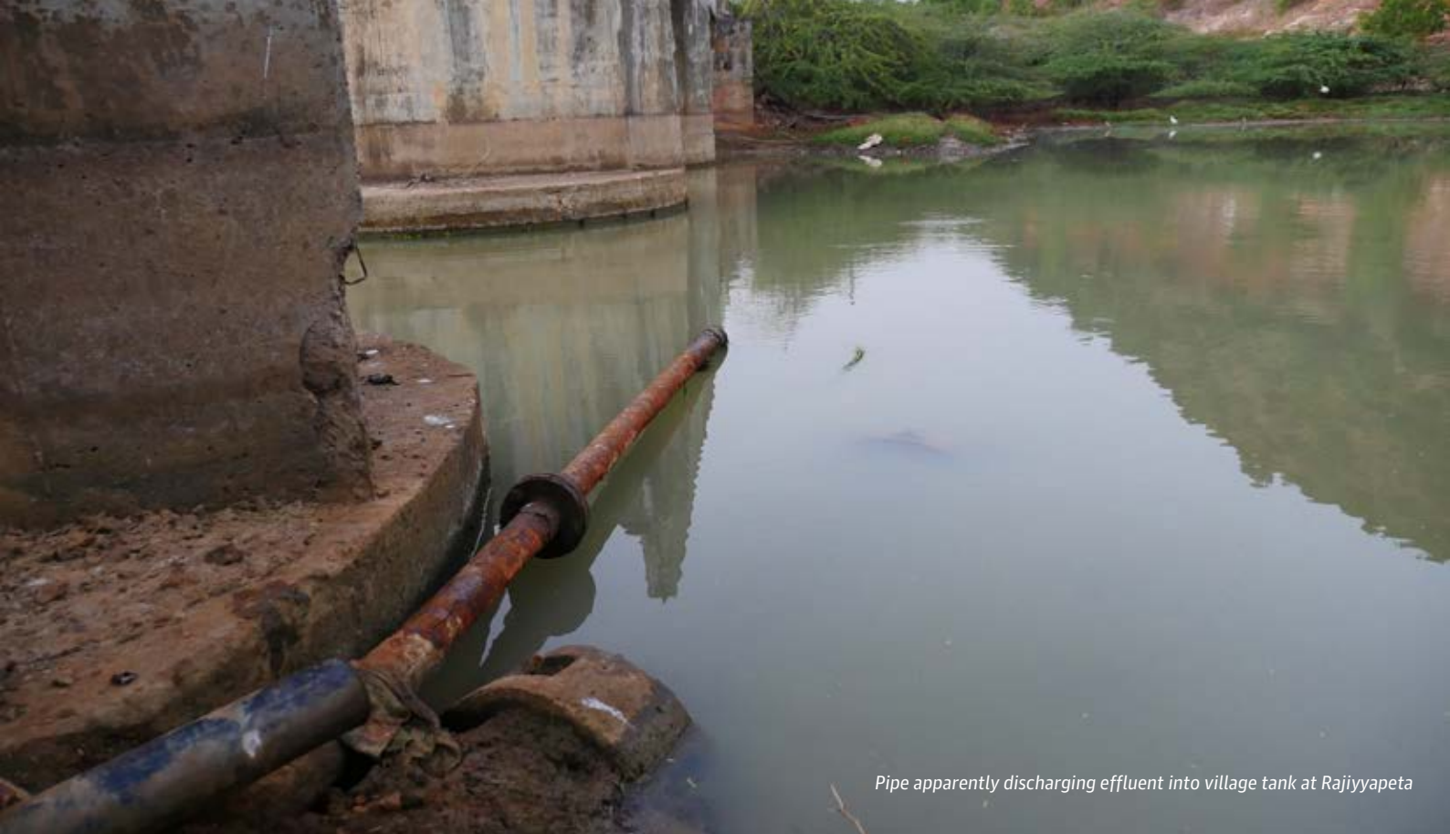
Pipe apparently discharging effluent into village tank at Rajiyyapeta

that sense, the development of Visakhapatnam has simply opened up a new front in the fight against pharmaceutical pollution.