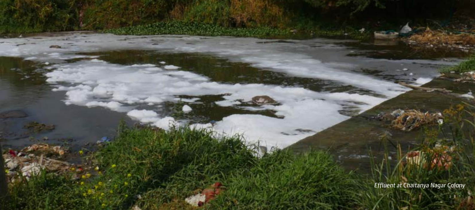
Effluent at Chaitanya Nagar Colony

wide nallah which leads out from the bottom of Hyderabad's Hussein Sagar lake, and is discharging large volumes of city waste directly into the river beyond the plant. A small proportion of the nallah water is being diverted through the plant, and mixed with the contents of other pipelines converging here. The investigation team observed two overhead pipelines which descend below ground at this point. They were told that one of these contains domestic waste from the Chardagard area of the city, and the other is the 18km Patancheru pipeline, and that a pipe here takes 20% of the water from the nallah and inputs into the Patancheru pipeline at this location. From here the pipe runs underground into Amberpet.