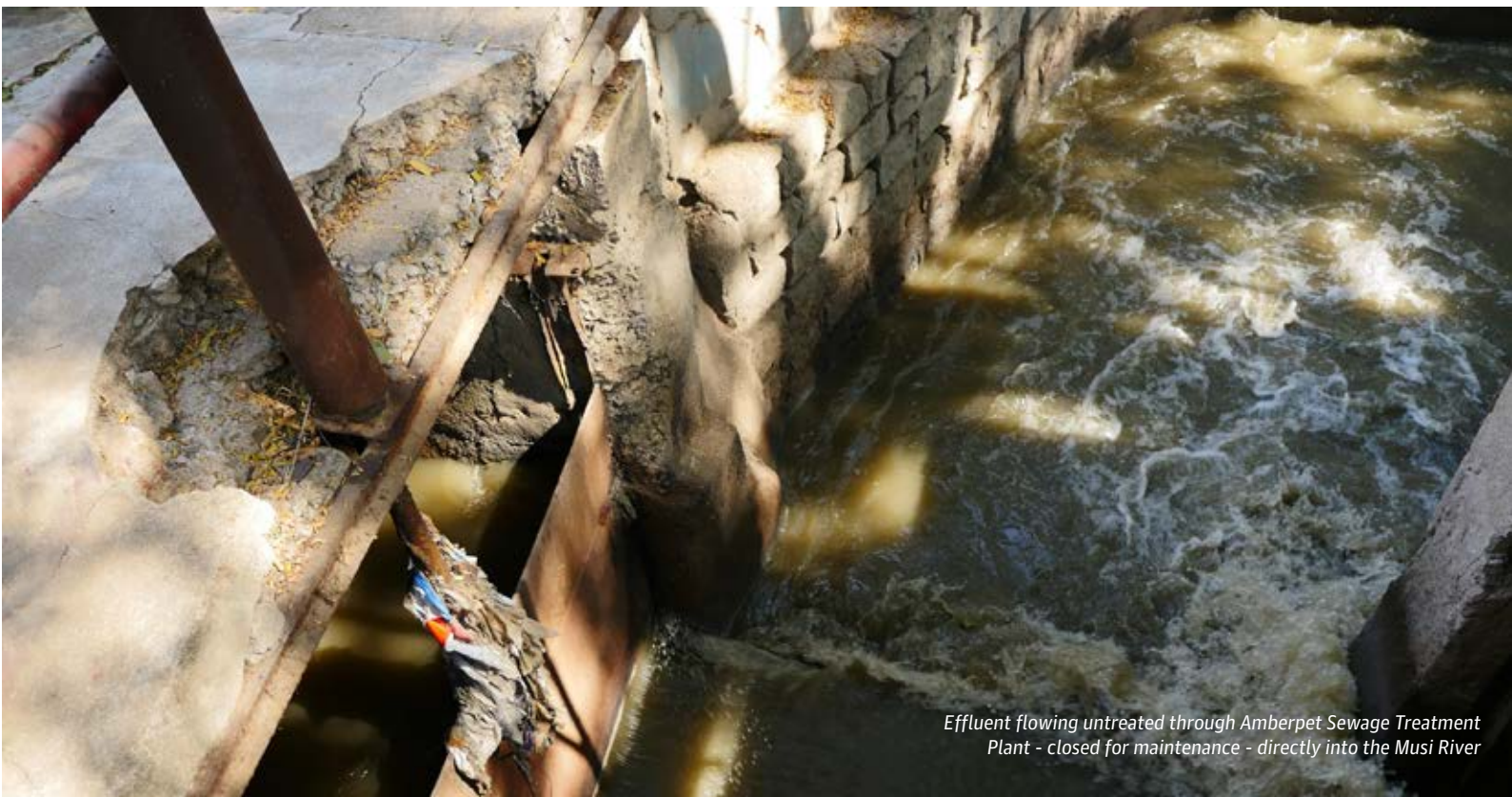
Effluent flowing untreated through Amberpet Sewage Treatment Plant - closed for maintenance - directly into the Musi River

A 2004 investigation by the Indian Supreme Court