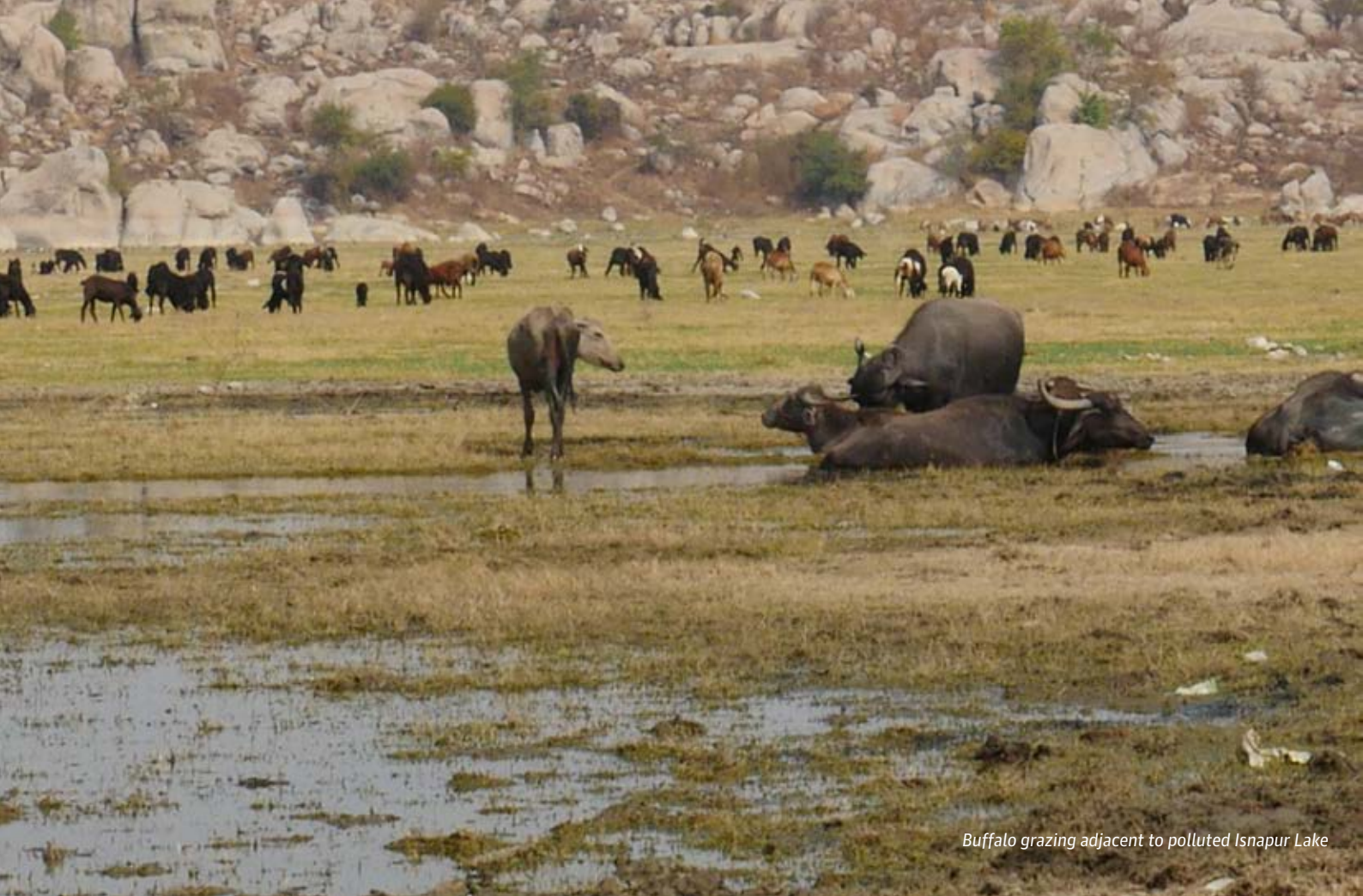
Buffalo grazing adjacent to polluted Isnapur Lake