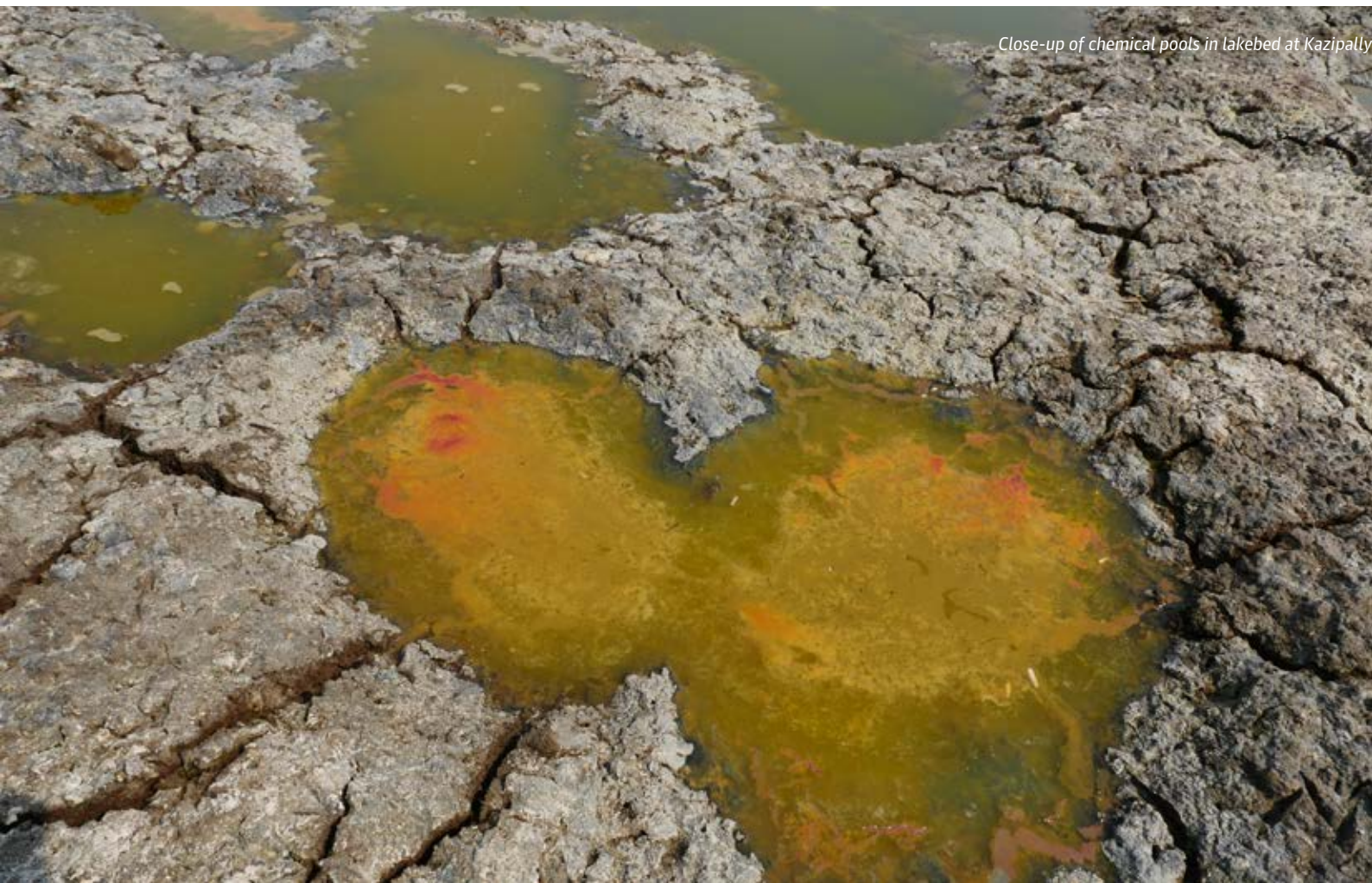
Close-up of chemical pools in lakebed at Kazipally

Gaddapotharam: Nallahs flowing downhill from Gaddapotharam industrial area, which contains many pharmaceutical companies and has no on-site CETP, enter into an existing irrigation system which traditionally watered the entire valley, and enabled a drought-prone region to achieve two crops per year for 400 years.