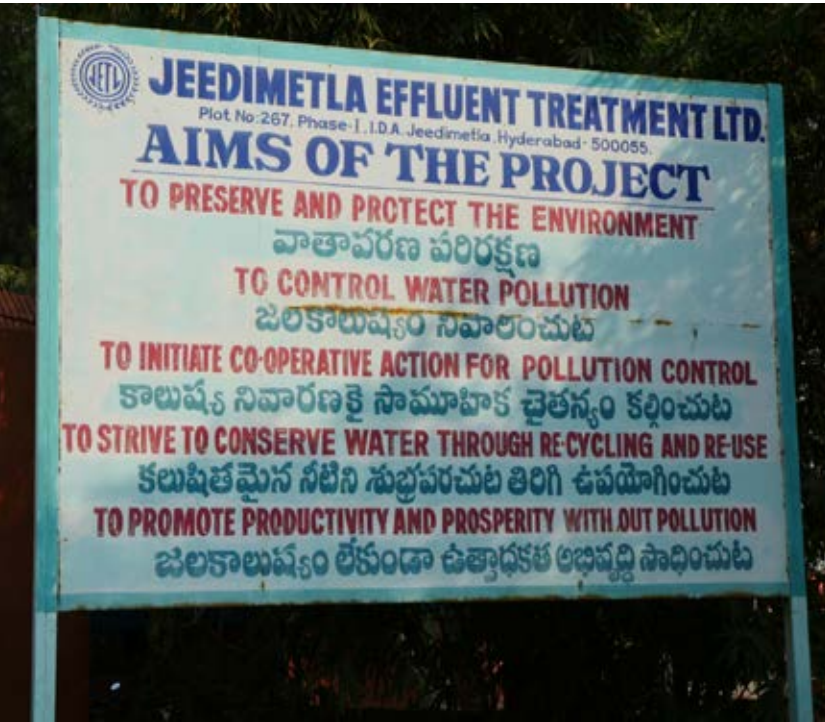
Information board at Jeedimetla Common Effluent Treatment Plant

product sludge waste to be stored in containers, buried in synthetic-lined pits to eliminate seepage. The site was intended to last 25 years before reaching full capacity. In practice, there has been seepage on a large scale, and capacity was overshot