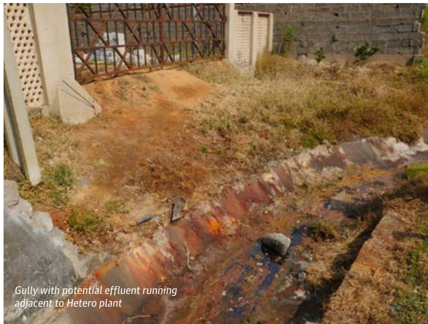
Gully with potential effluent running adjacent to Hetero plant