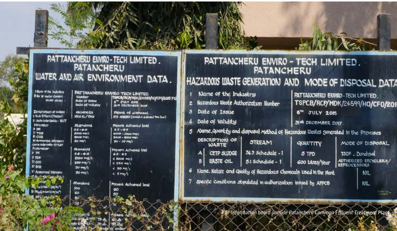
Information board outside Patancheru Common Effluent Treatment Plant

Companies from every stage of the production chain, including synthesis of intermediates and APIs, use the Patancheru CETP, with 200 tankers containing effluent reportedly entering the plant every day. At the plant, the investigation team encountered a high level of security, which prevented them from accessing the site. In 2007, a team of Swedish researchers alerted the international community to the possibility that the Patancheru CETP could be acting as a reservoir for the proliferation of antibiotic-resistant bacteria. They took water samples from the plant, which at the time served around 90 bulk drug manufacturers in the local area. The samples contained by far the highest concentration of pharmaceuticals reported in any effluent sampled to that point, with the presence of several broad-spectrum