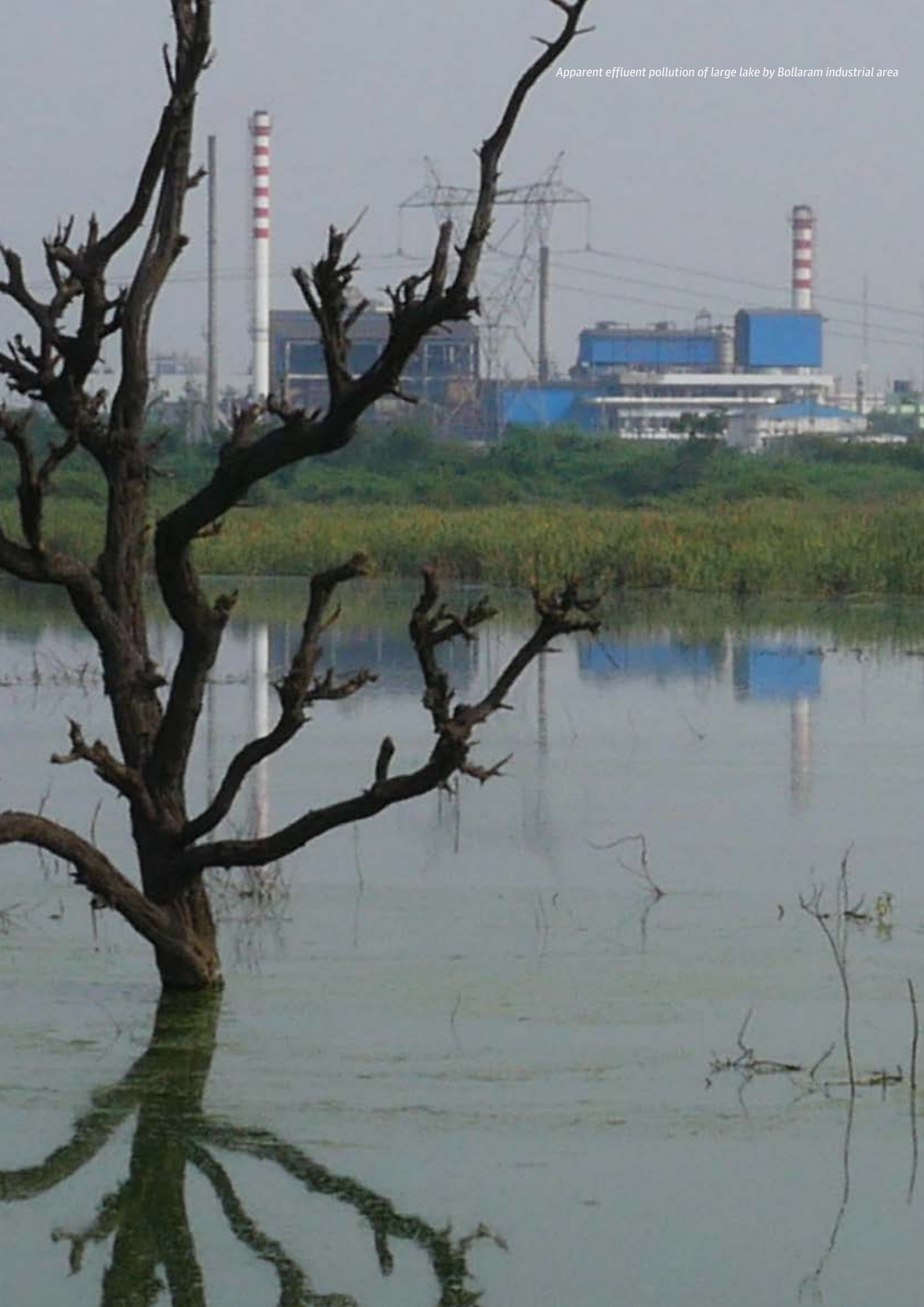
Apparent effluent pollution of large lake by Bollaram industrial area