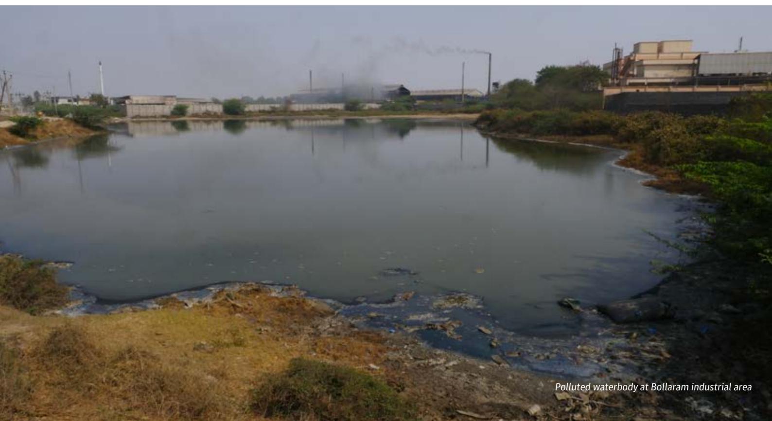
Polluted waterbody at Bollaram industrial area

The Patancheru industrial area itself contains many pharmaceutical companies and a variety of other polluting industries. Of the 106 units sending effluent to Patancheru Common Effluent Treatment Plant (CETP), the majority are pharmaceutical companies so it is clear that pharmaceutical