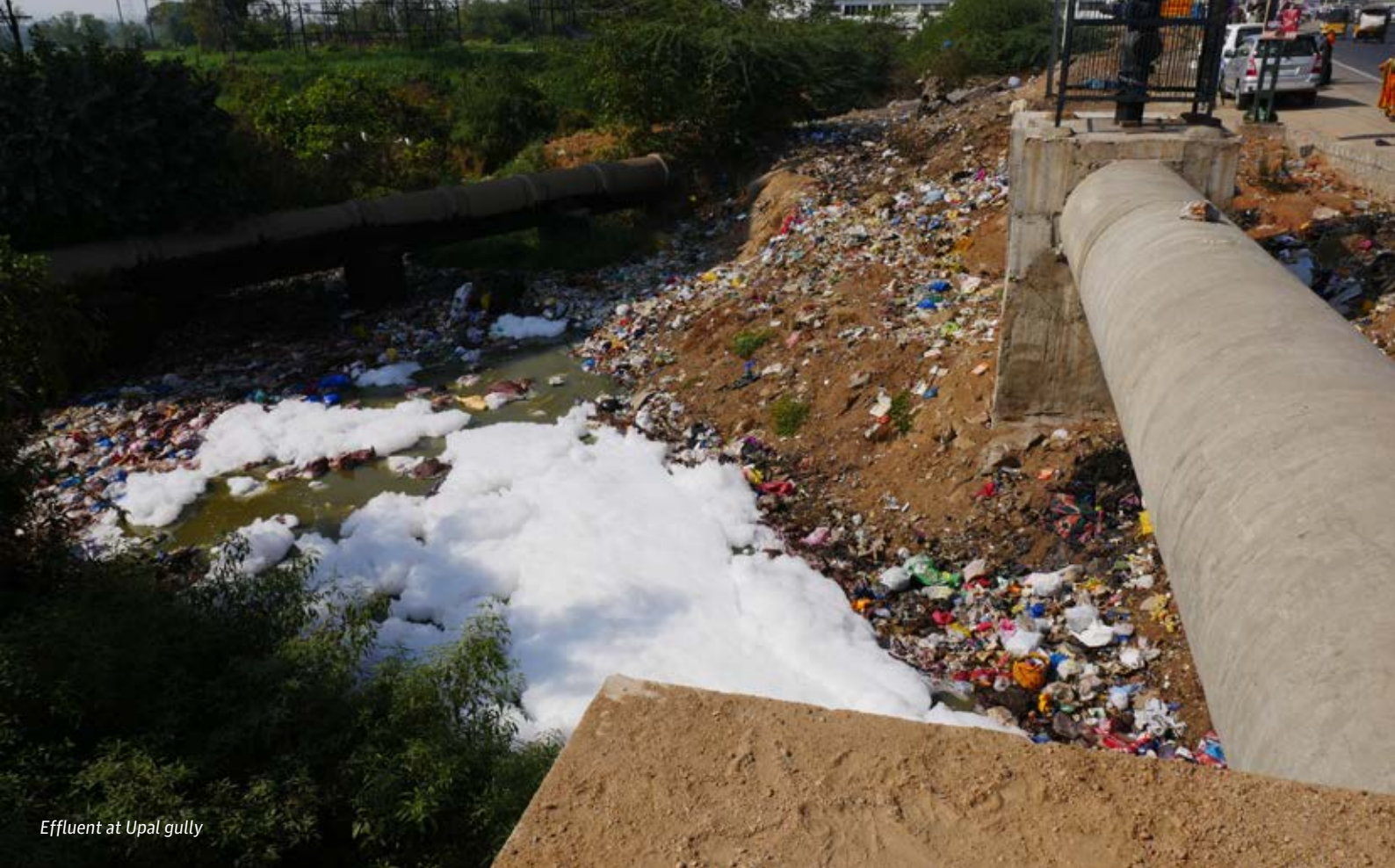
Effluent at Upal gully

Village informants reported to the team many serious health issues, including women having miscarriages, skin disorders, cancers, and intestinal problems. The livestock suffer from the same issues, for example goats have frequent miscarriages from eating the contaminated grass. The investigation team was told that nothing can be grown for human consumption in Kazipally village.