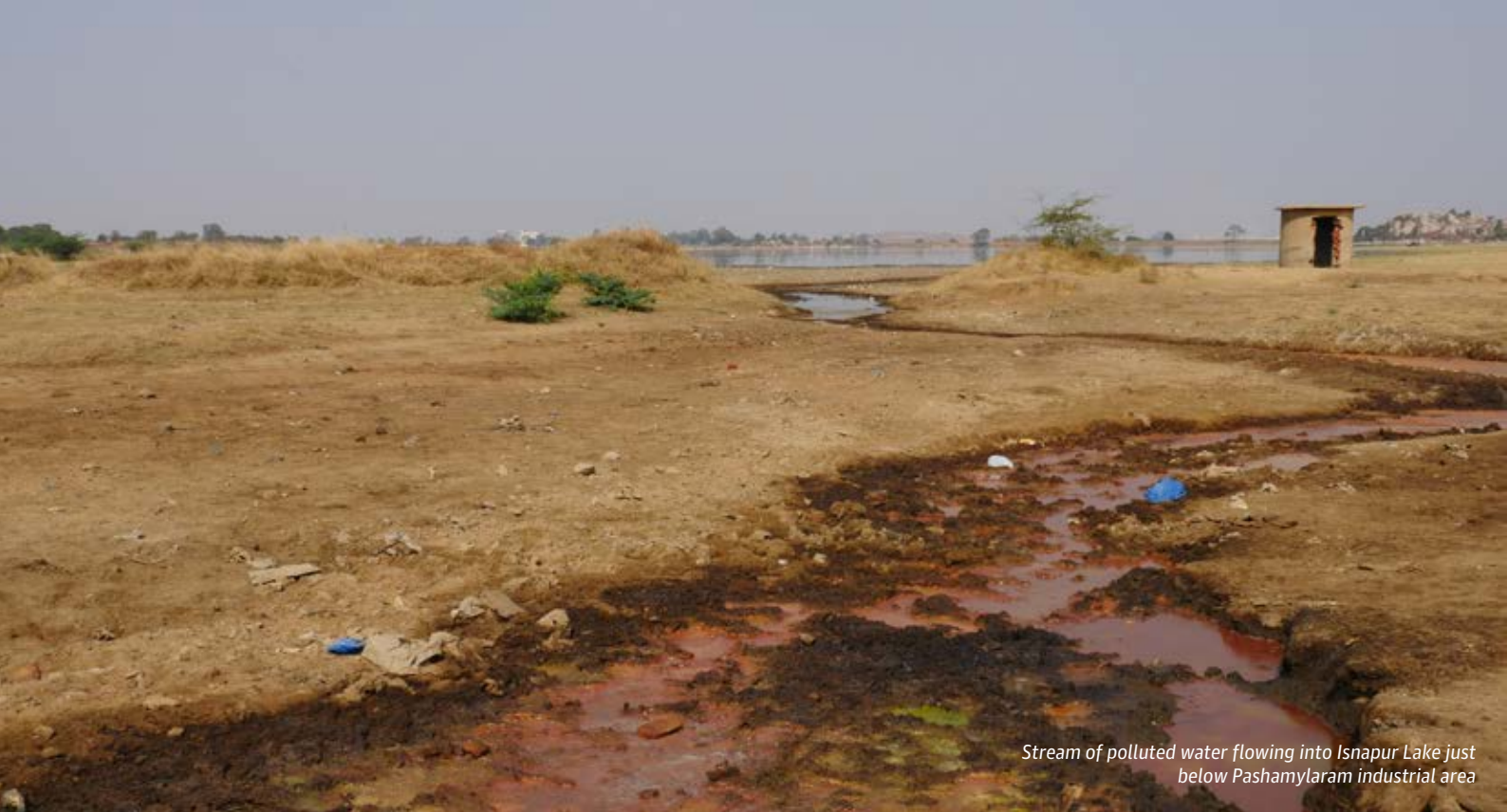
Stream of polluted water flowing into Isnapur Lake just below Pashamylaram industrial area

and from outside suppliers in tankers and that the nearest village (Borapatla) is just 500 metres away from the site. The Manjeera River, which is a key source of drinking water for Hyderabad, is 2.5km from the site. 126