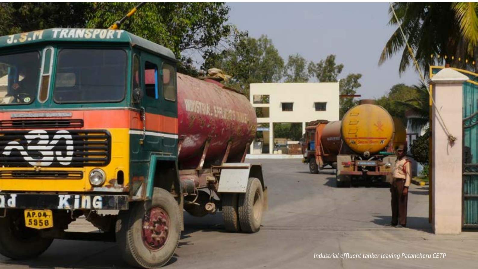
Industrial effluent tanker leaving Patancheru CETP

In 1997, a Supreme Court order resulted in the construction of an 18-kilometre pipeline to channel effluent from the Patancheru CETP to the STP at Amberpet, reported to be Asia's largest. From its very inception, the Amberpet pipeline project, which also receives waste from the Jeedimetla plant through Hyderabad's sewerage system, was vociferously rejected by environmental campaigners, who saw it as a way of just shifting the problem of pharmaceutical waste to another location within the Hyderabad area, and certainly not as an effective solution. 190 Almost twenty years on, its critics have sadly been proven right: the geography of pollution incidents has expanded to include new areas and the Musi River, which runs through the city of Hyderabad has become even more critically polluted. Furthermore, like the Patancheru CETP, the Amberpet STP does not have the capacity to remove any hazardous compounds, merely diluting the concentration levels of toxic and