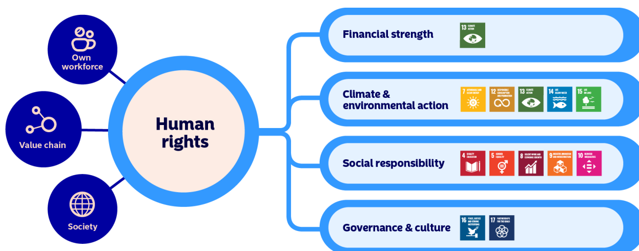
Illustration: The strategic pillars under our sustainability strategy are integrated into all aspects of our business operations.

We believe that managing human rights impacts and avoiding adverse human rights impacts is not only the right thing to do, but also a smart thing to do, as such impacts may, over time, become risks to the business.